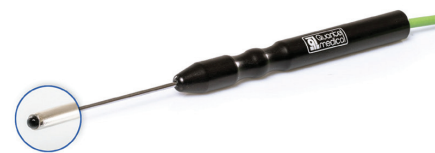
Figure 4. SubCyclo probe.