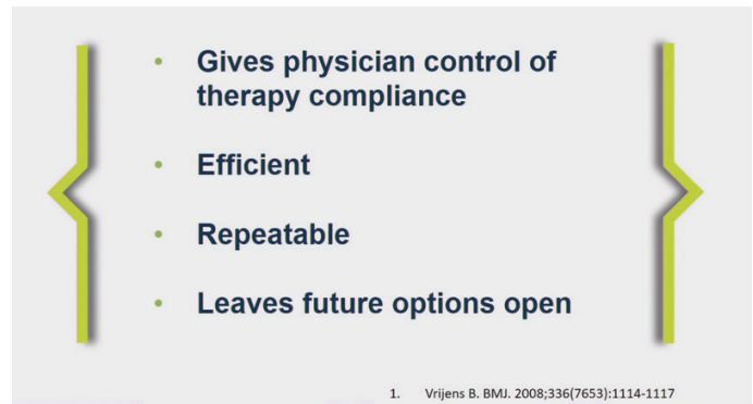
Figure 1. SubCyclo offers better control of outcomes in chronic disease management.

Fourth, we desire to leave future options open. For example, we do not perform any procedure that would negatively affect the conjunctiva or Schlemm canal if we will need to perform another procedure in the future.